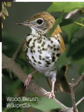
Wood Thrush Wikipedia

— Kenn Kaufman, author of Birds of North America