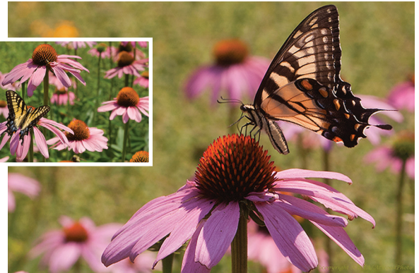
Eastern Tiger Swallowtail, Papilio glaucus , on Purple Coneflower, Echinacea purpurea .