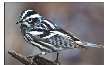
Many species of warblers, like this Black and White warbler, stop during migration and also nest throughout Stony Creek Valley.

There is an access at Cold Spring Road at Indiantown Gap 7 or 8 miles from Dauphin. Gold Mine Road crosses the railroad bed another 5 or 6 miles east of Cold Spring. You can continue east on the railroad bed to a dead end at the Lebanon Reservoir from this point. This valley is excellent for spring migrants. There are many interesting breeding birds here including: Barred Owl, Whip-poor-will, Red-shouldered Hawk, Blue-headed Vireo, Winter Wren, and many species of warblers.