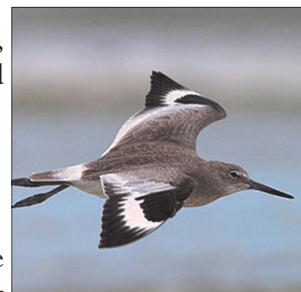
Willetts sometimes show up during migration along the Susquehanna River at the West Fairview boat launch.

Another excellent vantage point along the River is just north of Harrisburg at Fort Hunter Park. A large variety of waterfowl is possible here, and it is an excellent location